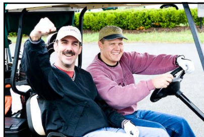
Let the games begin!!

At the end of the 18 holes, golfers were again invited into the club house to enjoy a deli style buffet while receiving awards for the three top teams. A 50-50 raffle, door prizes, and other awards kept the crowd excited throughout the event.