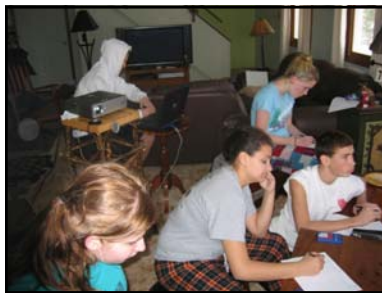
Students studying for Academic Bowl

Right after Thanksgiving, the team came together and began their journey, practicing during lunch time on a daily basis and after school in the evening twice a week. They aimed to be ready for the regional tournament at West Virginia School for the Deaf and Blind during the first weekend in March. It is with much thanks to